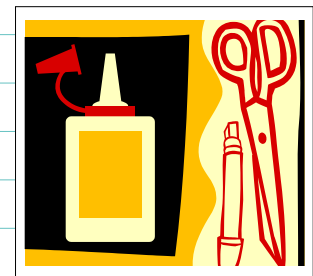
Tools for SUCCESS!